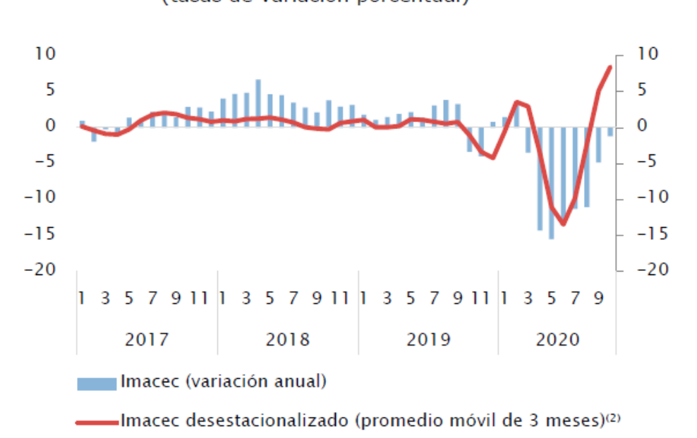
Gráfico 1: Imacec (tasas de variación porcentual)

Meanwhile, the fall in the seasonally-adjusted Imacec was explained by the performance of services, partly offset by the production of goods (figure 3).